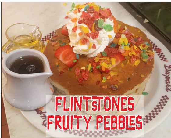
FLINTSTONES FRUITY PEBBLES